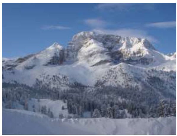
Hotel « Hohe Gaisl » with Mount Gaisl