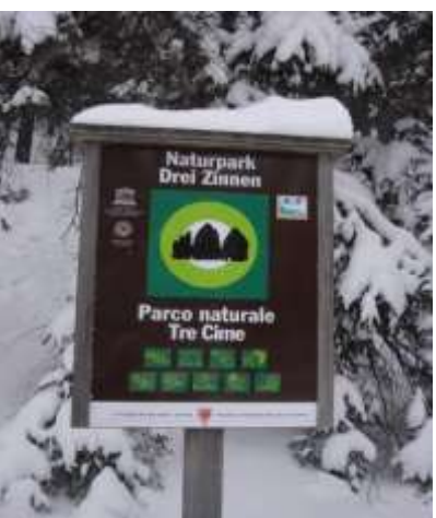
Restaurant « Talschlusshütte » in heart of the Dolomites